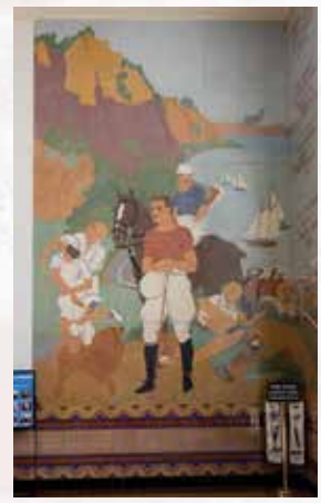
The Santa Monica Conservancy is leading efforts to protect these threatened murals by educating the community about their history and meaning in the face of objections by some about the way they present local history.