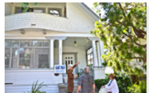
The Conservancy led a tour of the 3rd Street Historic District last spring.

According to a 2011 study in Connecticut, "property values in every local historic district saw average increases in value ranging from 4% to over 19% per year." In New York City from 1980-2000, local historic district properties on a price per square foot basis increased in value significantly more than non-designated ones. Further, historic district property values were found to resist market downturns better than the values of non-designated properties. A recent study investigating mortgage foreclosures of