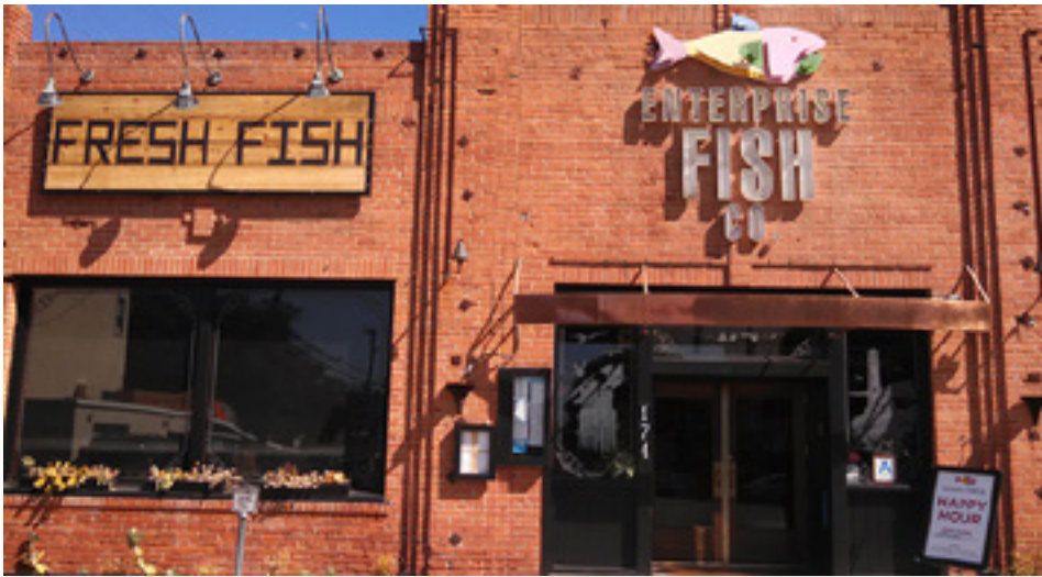
174 Kinney Street/171 Pier Avenue (Pacific Electric Building)