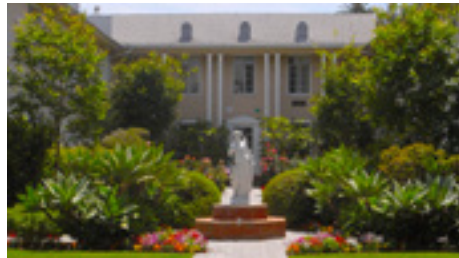
515-521 San Vicente