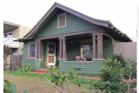
This landmark at 642 Kensington Road received a Mills Act contract in 2013

Why then, is the Conservancy so concerned about a cap on the contracts? We believe it will create a disincentive to designate and apply for a contract because of factors out of the property owner's control. After investing the significant funds necessary to produce an application, the owner of a modest property could find that the