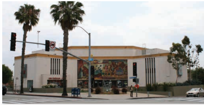
New landmark 2600 Wilshire Blvd, the former Home Savings building

The creation of a new Zoning Ordinance is an immense effort intended to incorporate the land use goals of the Land Use and Circulation Element (LUCE) into a document that will govern growth in Santa Monica over the next twenty years. A subcommittee of the Landmarks Commission