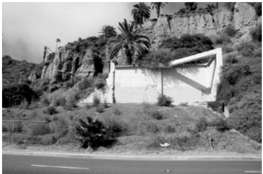
You've driven by this many times. What is it?