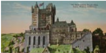
Artist's rendering of the proposed massive cliff hugging Gables Beach Hotel Club in the 1920s.