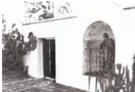
Cemetery wall with San Lorenzo Statue, 1937.