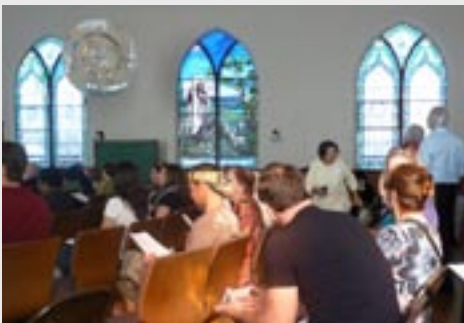
Interior of the Church in Ocean Park