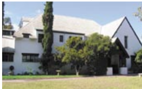
Top of the page: Historic rendering, Los Angeles Times, October 4, 1925, from the Consultant's report by PCR Services. Above: 2009 La Mesa Drive