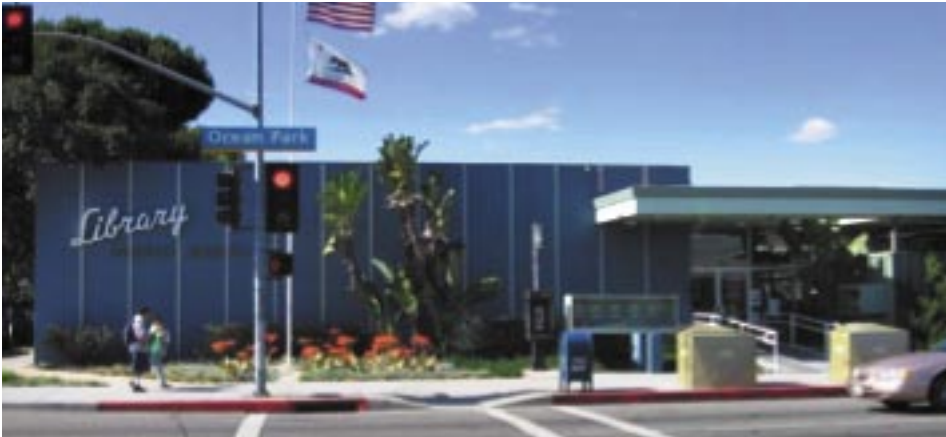
Library, 2101 Ocean Park Boulevard, constructed in 1956

Santa Monica's Historic Resources Inventory update is now complete, after a five-year process that involved the review of all 11,072 properties built before 1968. The survey consultants looked for properties that might be eligible for landmark designation or that might become part of an historic district pending further research. Cities create and maintain these surveys because it is one of several requirements of a "Certified Local Government" through the National Parks Service intended to legitimize a city's local program and allow it to take advantage of such preservation resources as grants from the state and other incentives. The survey becomes a critical planning tool on the local level by creating an awareness of which structures should be studied before demolition is approved and where concentrations of historic resources create irreplaceable neighborhood character.