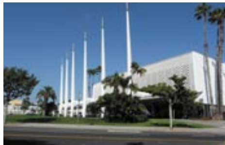
The Civic Auditorium

Thanks to an outpouring of support from the community as well as from the Los Angeles Conservancy, the California Preservation Foundation and the National Trust for Historic Preservation, funds have been made available to seismically strengthen and renovate the iconic