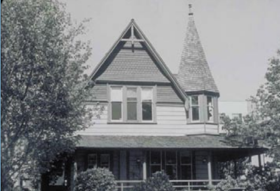
Gussie Moran House, located at 1323 Ocean Avenue, was built between 1887 and 1891. The architect is unknown. It was designated a landmark January 27, 1979.

Imagine the little town of Santa Monica in the late 1880s. Although many structures were architecturally undistinguished, prestigious Ocean Avenue filled up with imposing