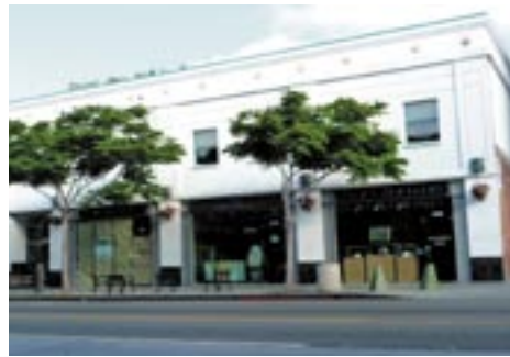
Photo dated: May 31, 2010.

The photo was taken on Fourth Street at Santa Monica Blvd. The Security-First National Bank building still stands. Originally located 50 feet east of Fourth Street on the northeast corner along Santa Monica Blvd, it had a parking lot on the west side along Fourth. In 1925 the storefronts along Fourth were added.