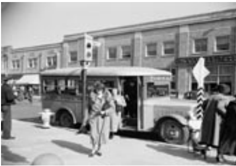
Photo dated: February 17, 1938.