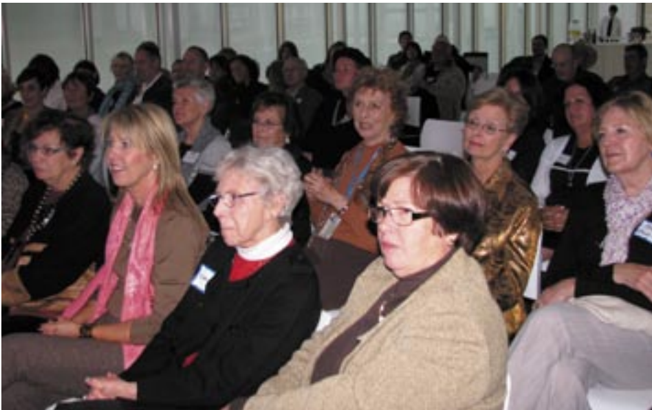
Docents react to seeing Marion Davies on screen in the silent comedy, “The Patsy.”