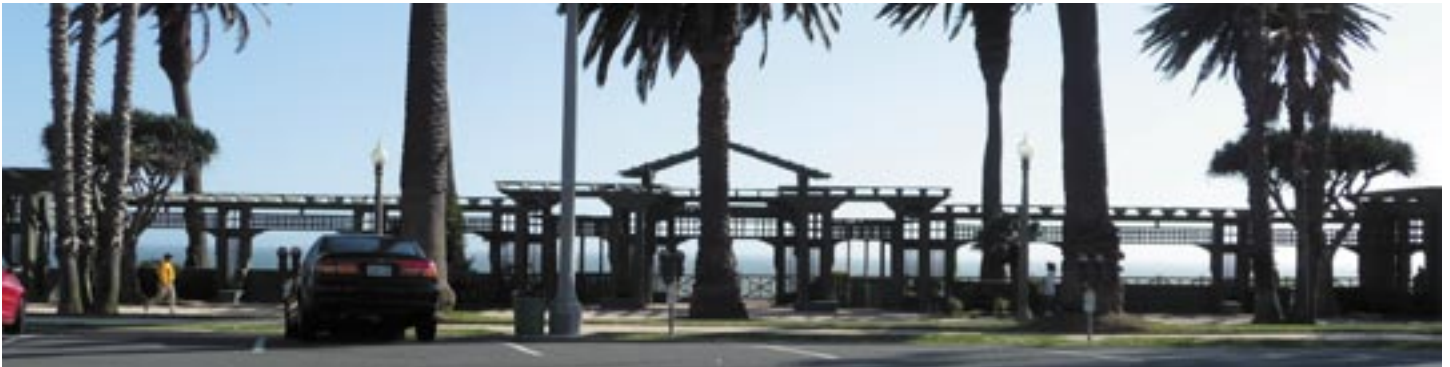
The pergola is one of Palisades Park's best-known features and is used in the logo of the Conservancy.

Palisades Park is one of Santa Monica's most familiar places... and is almost as old as the City itself. But how much do you really know about it? On Sunday June 13, 3 - 6 pm, you are invited to a docent-led tour of this rich cultural landscape, including its history and development, geology, landscape design and plants, commemorative monuments and historic structures.