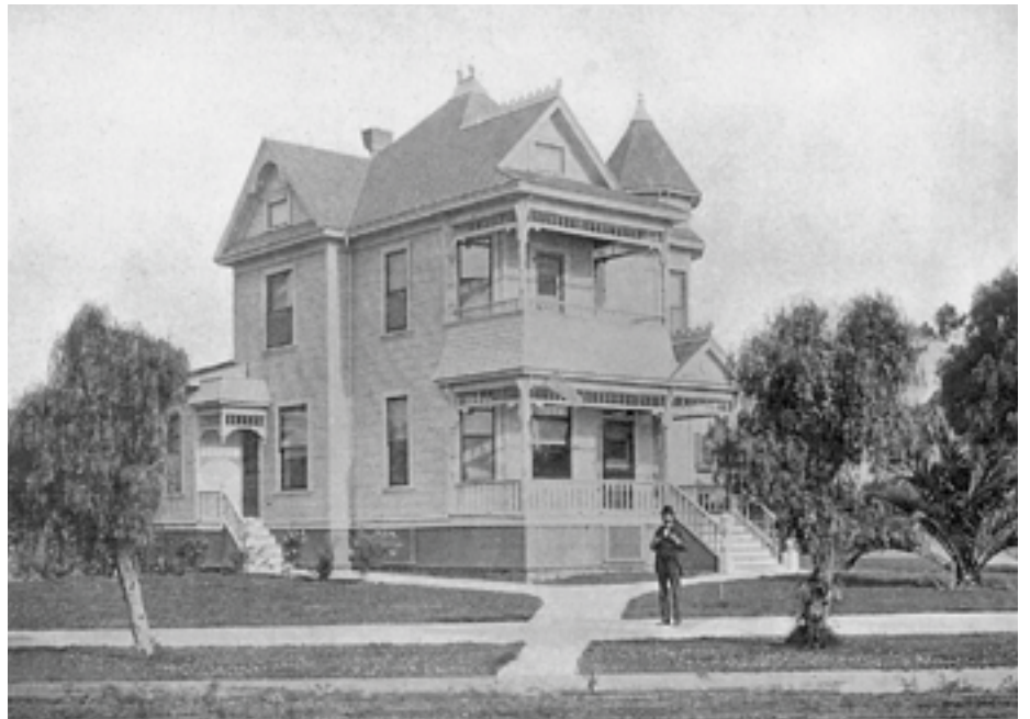
Do you recognize this house? It's no longer in its original location but you've driven by it many times. See page 6 for the answer.