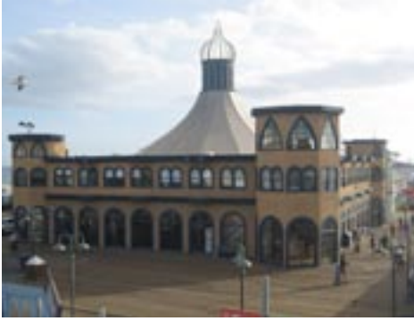
Onion Dome to return to the Looff Hippodrome Building