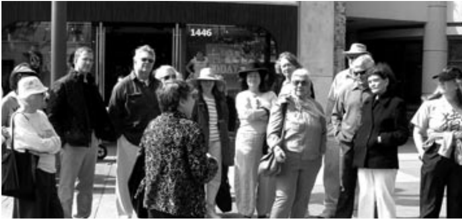
The colorful, early days of Santa Monica come to life in the Downtown Walking Tours