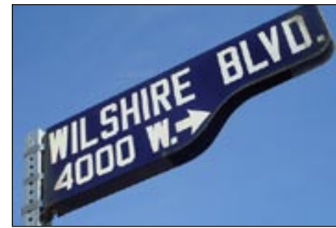
Paving the Way: The Stories behind the Names of L.A.'s Streets Weekends, July 11-September 30 2-4 pm

http://alhambrapreservation.org/APGsite/events/2009_Tour/2009tour.htm