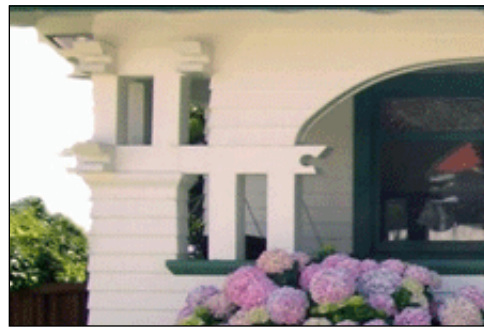
2009 Architectural & Historical Home Tour Saturday, June 27 see website for time

http://www.smpl.org/June2009Calendar.pdf