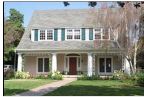
2009 Alhambra Historic Home Tour Sunday, June 28 11:00 am - 4:00 pm

http://www.redondbeachhistorical.org/hometour.html