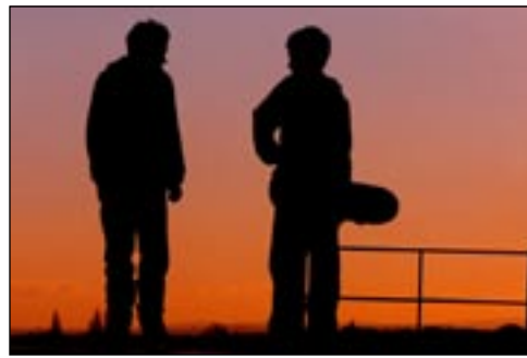
Go Skateboarding Day Saturday, June 20 2 pm

Santa Monica Public Library, MLK Jr. Auditorium 601 Santa Monica Boulevard, SM, CA 90406