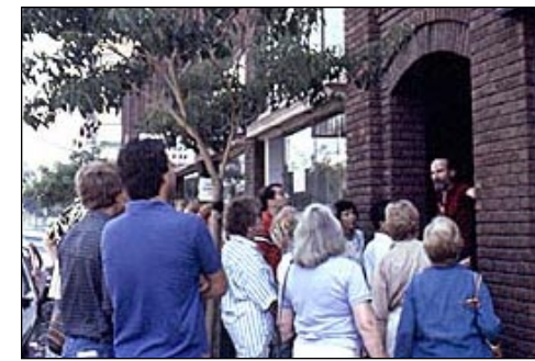
Old Pasadena Walking Tour August 1 9:00 - 11:00 am

Pasadena Heritage 651 South Saint John Avenue Pasadena, California 91105-2913