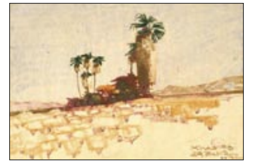
Richard Neutra, Architect: Sketches & Drawings Through September 6 Open during regular library hours

Los Angeles Public Library, Central Library, Getty Gallery 630 W. Fifth St., Los Angeles, CA 90071