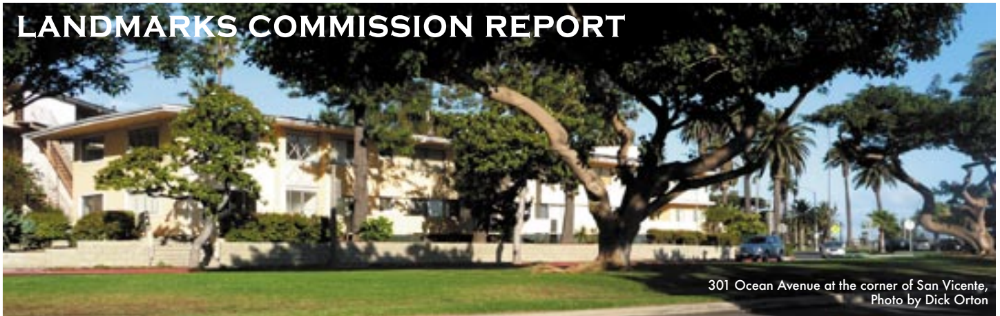
301 Ocean Avenue at the corner of San Vicente