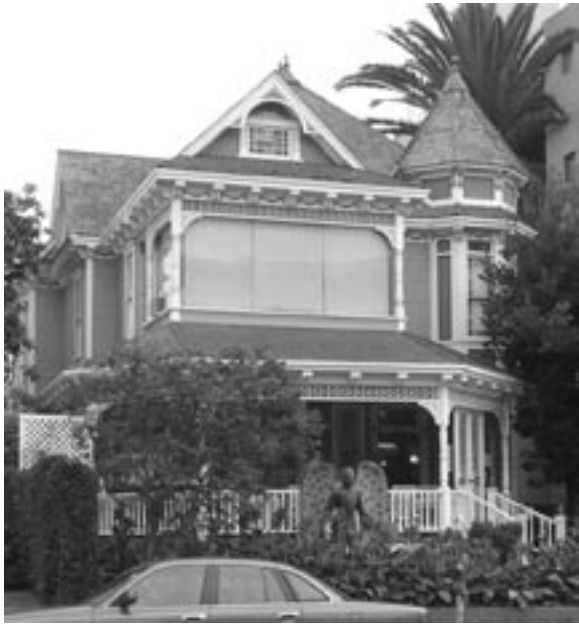
Visitors to Angel's Attic can enjoy afternoon tea on the verandah.

ONE OF SANTA MONICA'S FEW REMAINING VICTORIANS IS NOW A MUSEUM SHOWCASING ANTIQUE DOLLS, DOLLHOUSES, TOYS AND MINIATURES