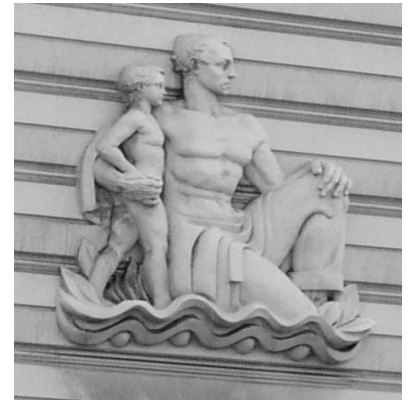
DETAIL OF SEARS BUILDING AT 302 COLORADO BOULEVARD 1946

SMC may turn the booklet into a walking tour guide of historically and architecturally significant downtown buildings.