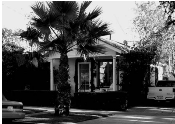
BUNGALOW AT 1414 IDAHO AVENUE

Many of the older buildings in this area were replaced by modern apartment buildings in the 1950s and 1960s, and more