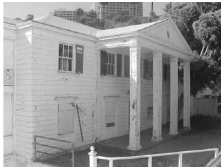
THE MARION DAVIES ESTATE TODAY

There is no single historic resource as richly significant on so many levels as the Marion Davies Estate. Such a symbol in public hands can be used, enjoyed, studied and understood by the residents and visitors of our community. Will 415 PCH stay in public hands?