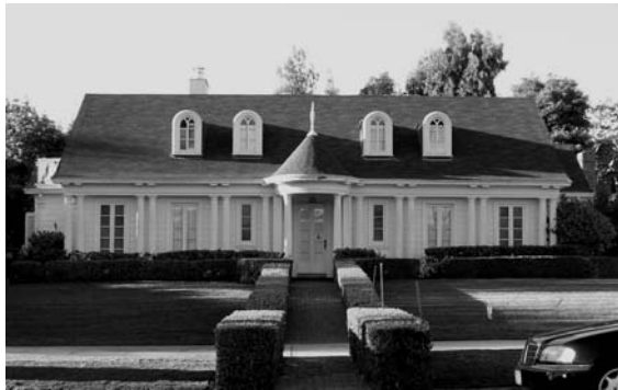
SYMMETRY AND ELEGANCE AT 147 GEORGINA