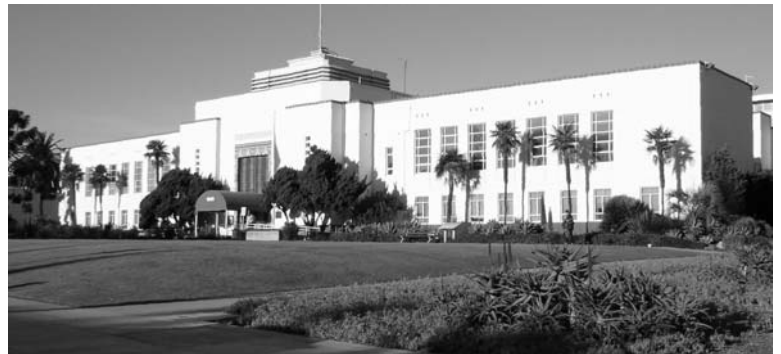
SANTA MONICA CITY HALL WAS BUILT IN 1939