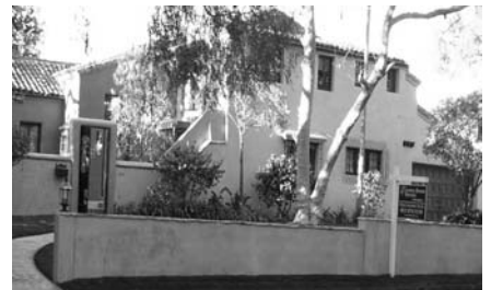
UNDESIGNATED JOHN BYERS HOME ON LA MESA DR. CURRENTLY FOR SALE A new city ordinance (passed

For many buyers, a property that is historically or architecturally significant has added cache. For others, such a building may seem less desirable, given some limitations apply to exterior remodeling and demolition. Purchasers of historic and potentially historic properties are often not made aware of the historic status of a property and the accompanying development guidelines as well as the benefits of owning, rehabilitating and preserving historic property.