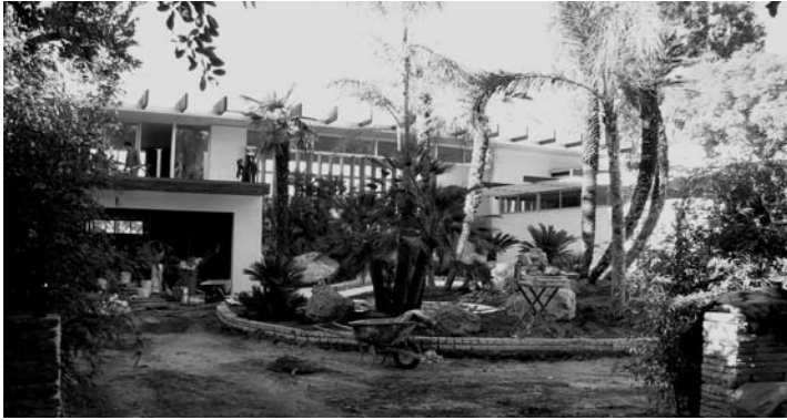
LANDSCAPE UNDER RESTORATION AT 1911 LA MESA DR.

When it was put on the market in 2002, a buyer intended to demolish this important house. A hue and cry went up from the preservation community that convinced that buyer to resell it. The current owners bought the home and are busy preserving and restoring it.