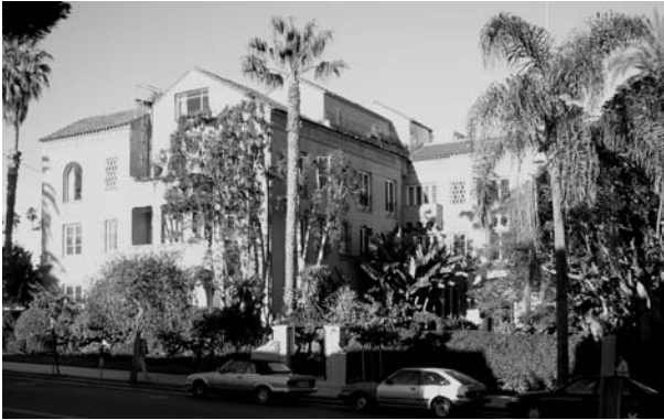
THE EMBASSY APARTMENT HOTEL

The Embassy, on the corner of Third Street and Washington Avenue, is a