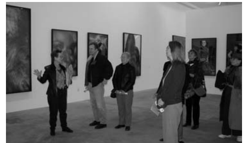
TOURING THE CINDY SHERMAN GALLERY