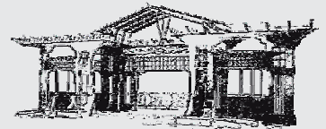
SANTA MONICA CONSERVANCY