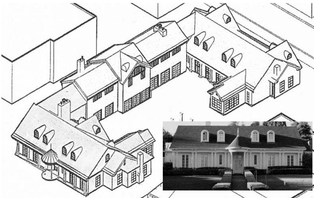
ABOVE: THE ADDITION IS SHOWN IN WHITE—INSET: FROM THE STREET IT IS UNCHANGED

entirely behind the existing house. The plan allows for a full underground basement, which adds considerable floor space. The height of the two-story addition is only a few feet more than the original and is partially hidden by mature trees, so that to the pedestrian, it will barely be perceptible. The addition is configured as a courtyard, with open space behind the rear central portion of Farquhar's house so that the rear elevation remains visible. The side setbacks are consistent with the side planes of the original house. Architecturally, the addition is based upon the style of the original, with some simplifications and subtle changes so that the new is distinguished from the old, in accordance with historic preservation design guidelines. The project required one standards variance, an exception to the depth of the required rear setback at the second story level. It was determined that this variance would not have an adverse effect on neighboring properties.