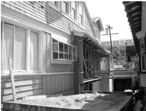
OWNERS MUST AVOID TRIGGERING SUBSTANTIAL REMODEL DURING RESTORATION

Redefining "substantial remodel" is a very significant step in creating a system of exemptions in the zoning code that would encourage preservation and adaptive reuse.