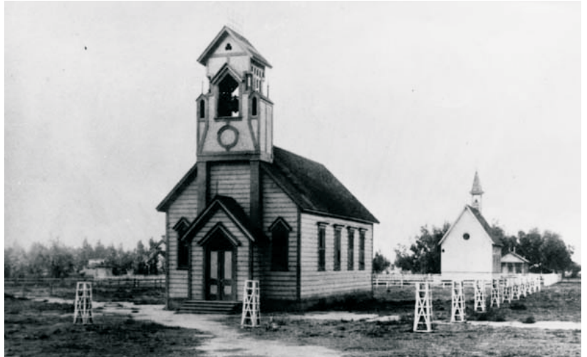
THE CHURCH STOOD AT 6TH AND ARIZONA IN 1875.

The Gothic-inspired redwood structure with high-pitched gables at 2621 Second Street in Ocean Park retains its ecclesiastical roots. Once a house of worship, it has become a house of residence. Built in 1875 by volunteer labor at a cost of $683, it housed a Methodist Episcopal church at the corner of Sixth and Arizona. The Santa Monica Land Company, owned by City founder Senator Jones, donated the land. It is currently one of the oldest buildings in Santa Monica.