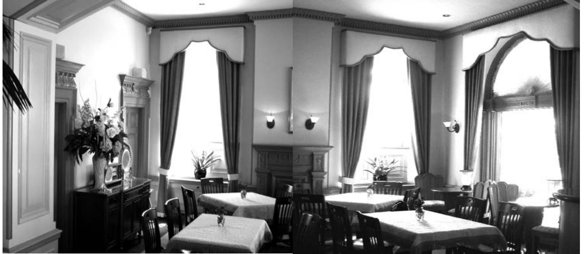
A MONTAGE OF THE GEORGIAN'S LOBBY SHOWS ABUNDANT ORIGINAL WOODWORK

The façade follows a typical tripartite Chicago skyscraper organization. The Ocean Avenue entrance features a pair of large plate glass windows and lion ornaments. The Art Deco elements include the row of butterfly-patterned metal grills, embossed block grill dividers, and plaster scrollwork on the central bays. Art Deco ornamentation on tall buildings became popular during the 1930s, evoking the new and optimistic spirit of progress and modernism associated with Southern California. It presents arched entryways, geometric marble floors and crown-molded ceilings. The interior colors are true to the era—pink, green and black. On each side of the lobby, contemporary furnished parlors allow guests to enjoy the ocean breeze. It features 84 guestrooms, including 28 spacious suites, most of which have panoramic ocean views.